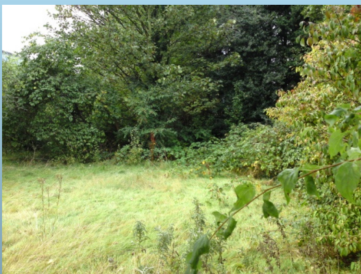
Some of the existing habitat assessed by our Suitably Qualified Ecologist.

MKA Ecology was commissioned to carry out an ecological CSH assessment for the redevelopment of land forming the gardens of three existing properties in Stevenage, Hertfordshire.