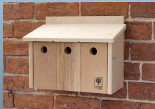
Nest boxes for House Sparrows were one of our key recommendations.

Working with our client we were able to offer practical recommendations in order to enhance the wildlife at the site. We were also able to provide advice on how to maximize the ecological value of the undeveloped areas in order to achieve the highest number of credits.