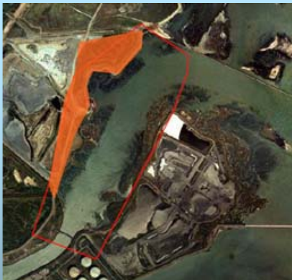
A view of the Winter bird survey area

MKA Ecology was commissioned to carry out winter bird surveys at Damhead Creek for the potential development of land adjacent to the creek.