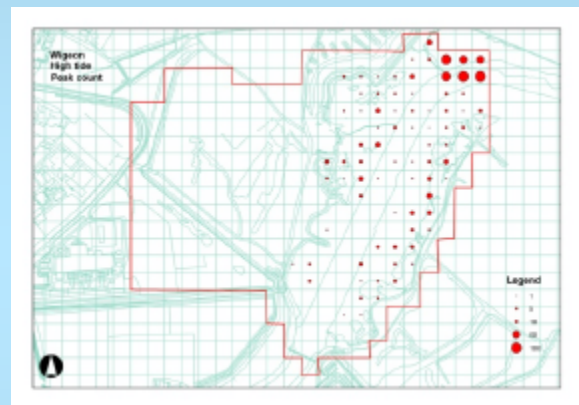
A map illustrating the peak High Tide count of Wigeon

The site was divided into appropriately sized grid squares on field maps, which allowed detailed analysis on the distributional patterns of birds within the creek. Our report was supported by detailed maps produced using ArcGIS software.